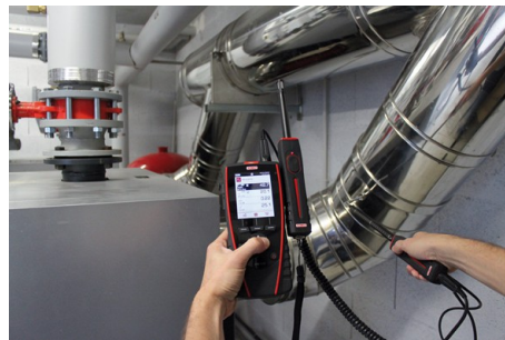
Hygrometry and air velocity measurement